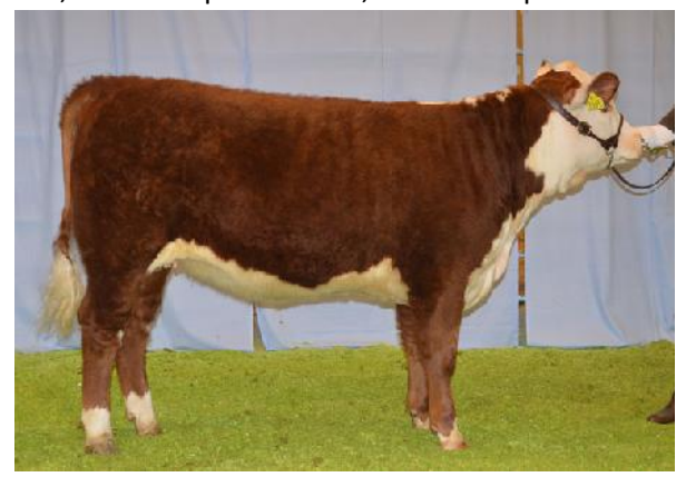
7395 Bårarps Genna

We have had two shows in Sweden this year. The first show at Mila in Malmö was a huge disappointment with regards to the number of Herefords entered. Only four females and one bull... But, the Champion female, 7395 Bårarps Genna did take a 2<sup>nd</sup> place in the Interbreed Championship.