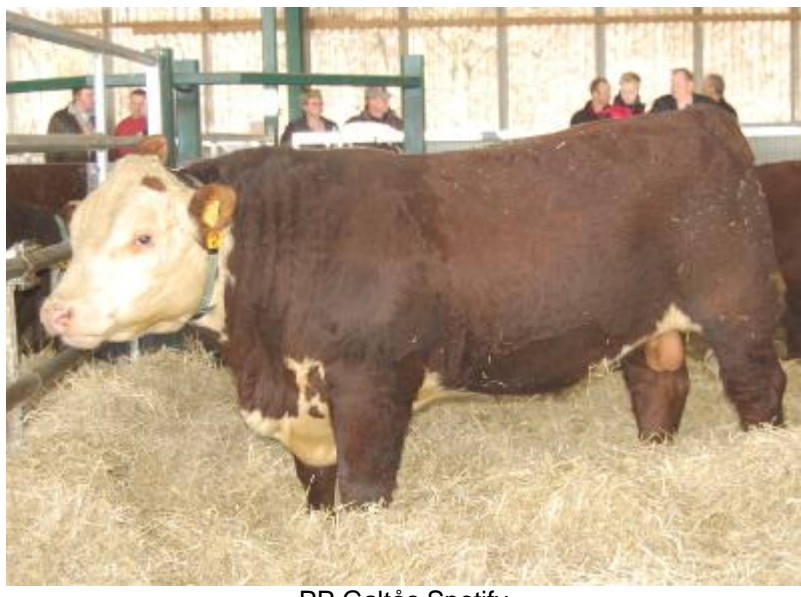
PP Galtås Spotify

The year began with the auction of approved performance tested bulls. 18 of the 30 bulls which took part, were approved (had an higher than average daily gain, passed the vet and had an acceptable conformation score). Viking Genetics bought two of the bulls for their AI program and the 16 others were sold at auction.